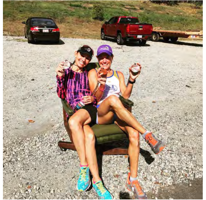
September- Salem Lake 30K & 7-miler