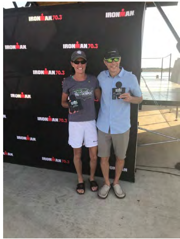
70.3 North Carolina