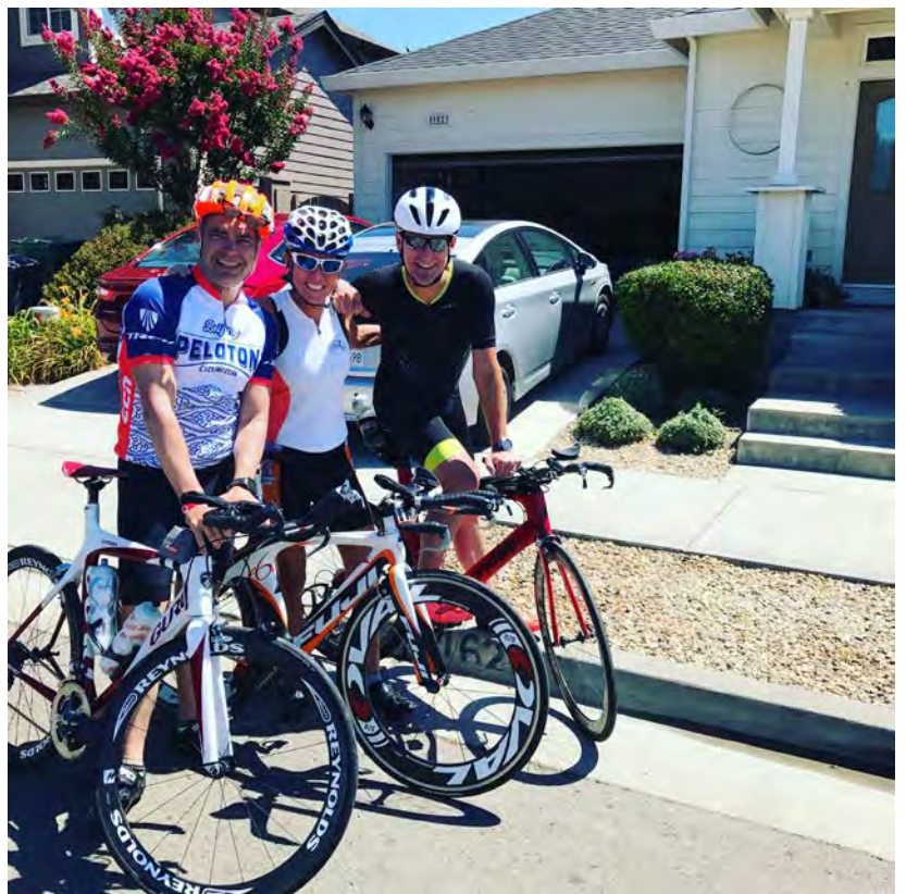
July- Ironman Santa Rosa