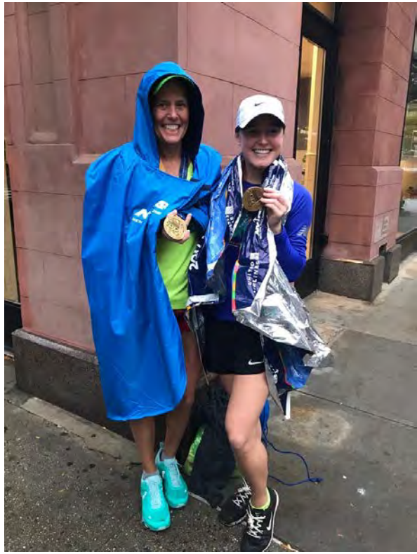
November- NYC Marathon