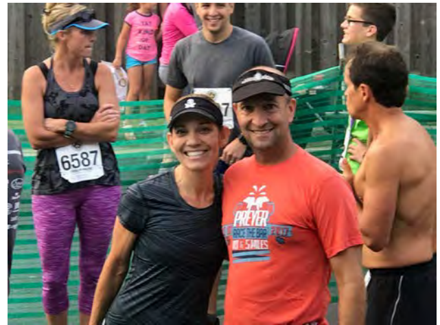
October- Horneytown Run for Hospice 5K