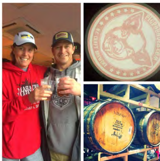
Pig Pounder 5K