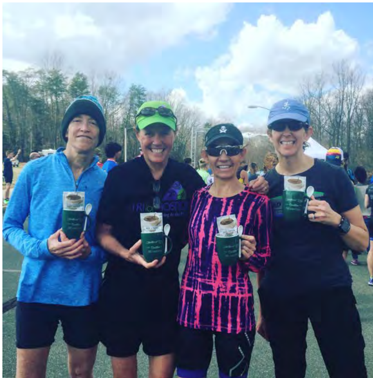
Northeast Park Duathlon