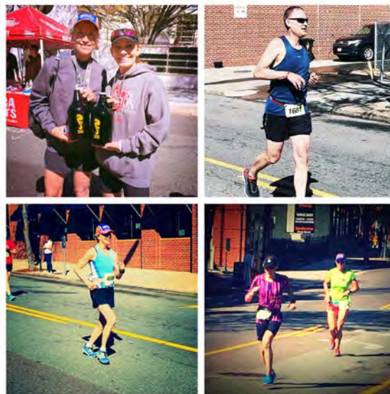
April- Hopfest 1/2 Marathon