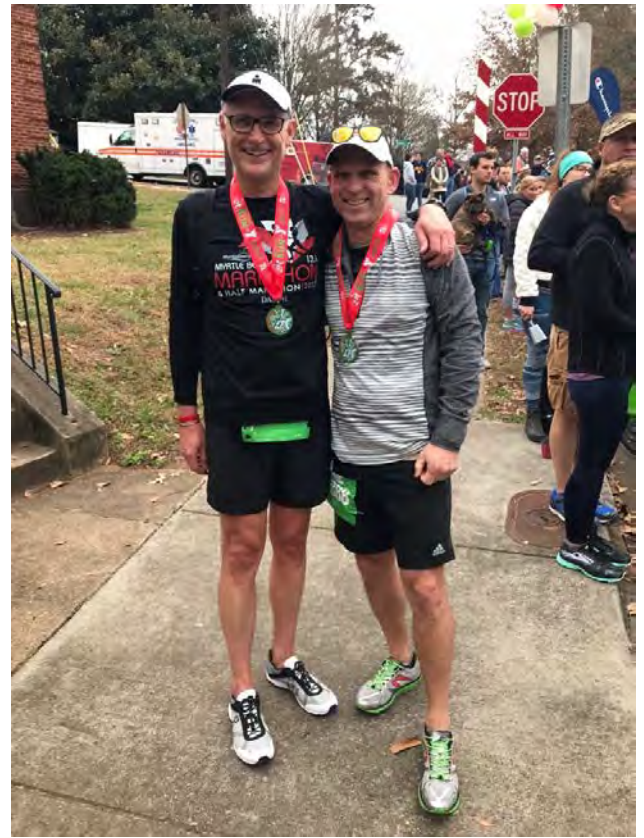
Mistletoe 1/2 Marathon