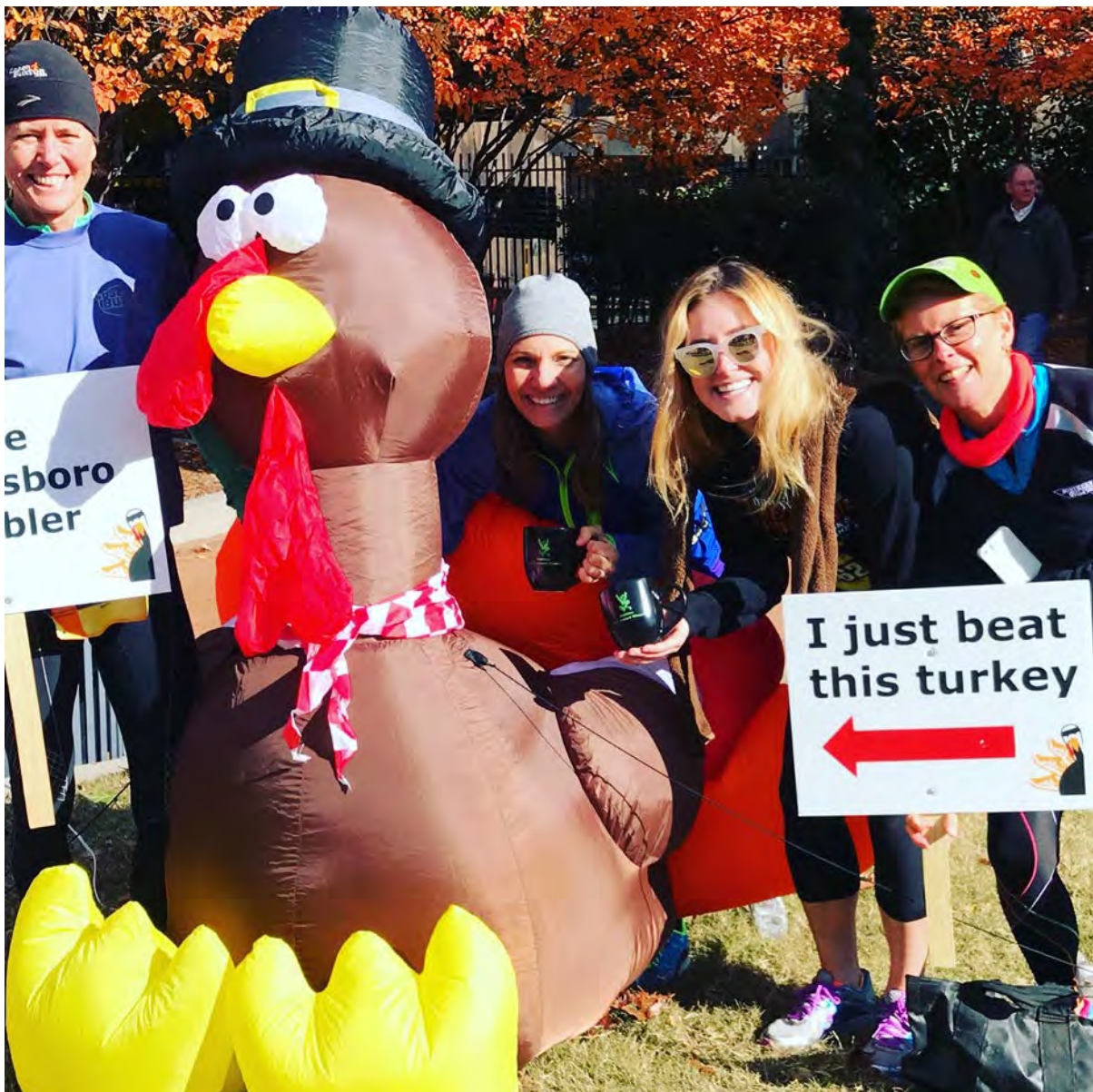
Greensboro Gobbler 5K