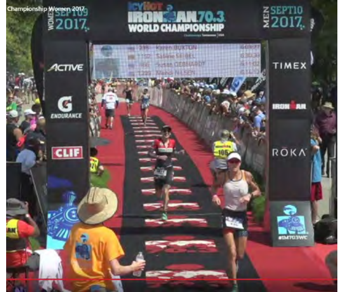
70.3 World Championships Chattanooga