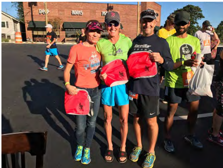
August- Race the Bar 10K