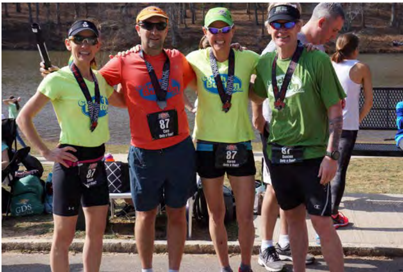
February— Massacre Marathon Relay