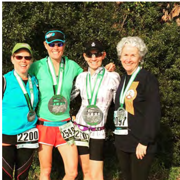
Oak Island 1/2 Marathon