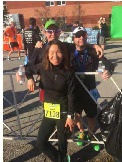
January-Charleston 1/2 Marathon