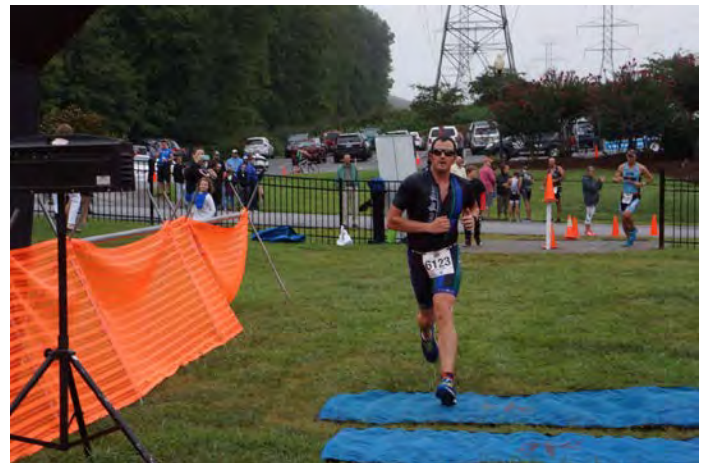
Ridgewood Try a Tri for Hospice