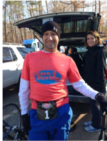
Cary ready to run!